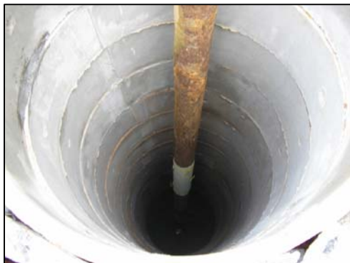
Recharge well around bore well