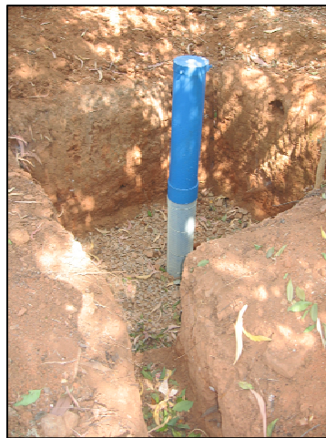
Recharge pit connected to a stormwater drain